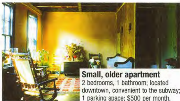
Small, older apartment 2 bedrooms, 1 bathroom; located downtown, convenient to the subway; 1 parking space; $500 per month.