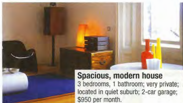
Spacious, modern house 3 bedrooms, 1 bathroom; very private; located in quiet suburb; 2-car garage; $950 per month.

A Imagine you are looking for a house or apartment to rent. Read the two ads. Then rewrite the opinions below using the words in parentheses.